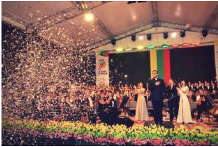
Musical capital of Colombia.