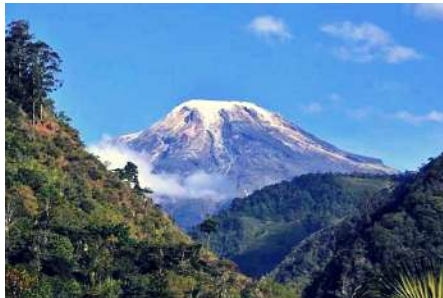
Nevado del Tolima.