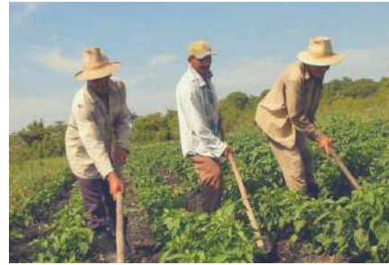
One of the major economies of Colombia.