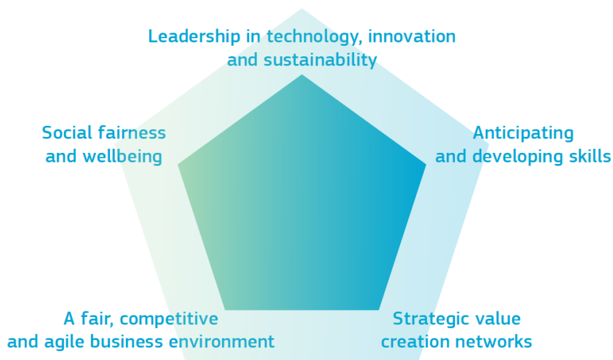
Slika 1: Prikaz petih področij, ki morajo biti gonilo za uveljavitev prihodnjega industrijskega modela Evrope

Five key drivers to achieve the Industry 2030 vision