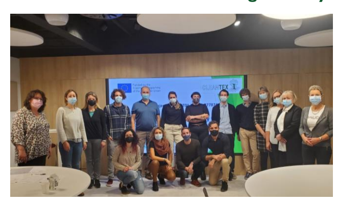
Partners during the meeting in Terrassa (Barcelona)

The IO2, that will dynamize students for seeking textile solutions from practical challenges and cases was presented. Then, LEITAT presented the IO3 , the e-book that will compilate practical cases on how to apply life cycle assessment and eco-design in the advanced textile manufacturing industry.