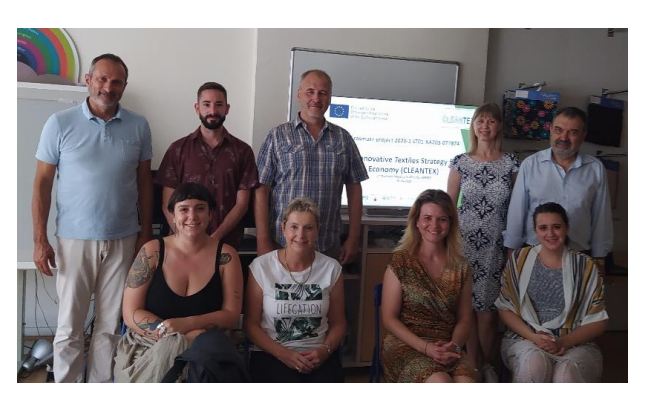
Partners during the meeting in Athens

Also, ENSAIT introduced the planification of the bootcamp training (IO2), that will be the platform where the summer training course will take place.