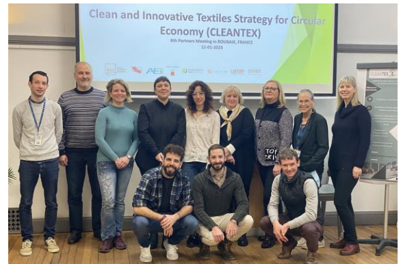
Cleantex partners during their meeting in Roubaix

After the meeting, partners had the chance to visit ENSAIT facilities and labs.